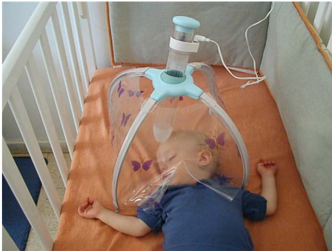
Figure 1. Aeroneb nebulizer attached at the top of the Baby Air device. Figure available in color online at www.jpeds.com .

It has been recently demonstrated scintigraphically in infants that inhalation via hood achieves a lung deposition of salbutamol comparable to that delivered by a conventional face mask. 7 Infants tolerated the hood better than the mask, and there was a significant positive correlation between poor acceptance and upper airways and stomach deposition for both treatment modalities. In addition, parents unequivocally preferred the hood treatment. The present double-blinded placebo control trial was designed to compare the efficacy, safety, and tolerance of hood versus the face mask interface in delivering aerosol medications to infants hospitalized with RSV bronchiolitis and in whom aerosol treatment is considered.